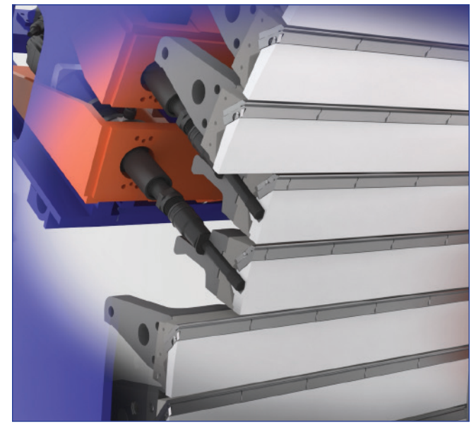
The automated nutrunner system ensures positive clamping for safe operation and consistent strand quality.