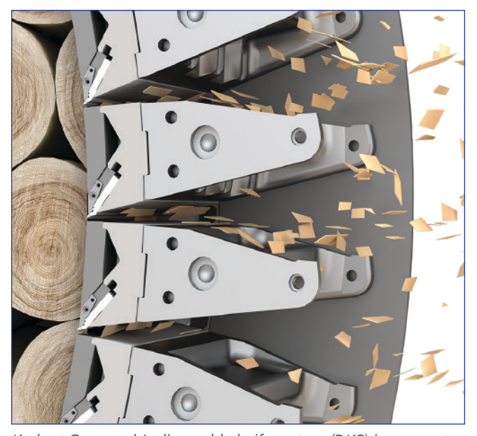
Kadant Carmanah's disposable knife system (DKS) is proven to increase strander utilization by as much as 2%.