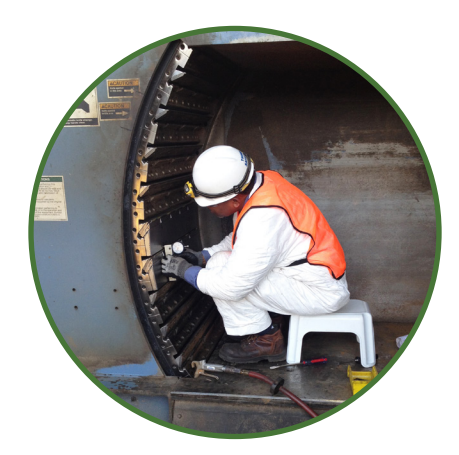
2 personnel 6 hrs / quarter