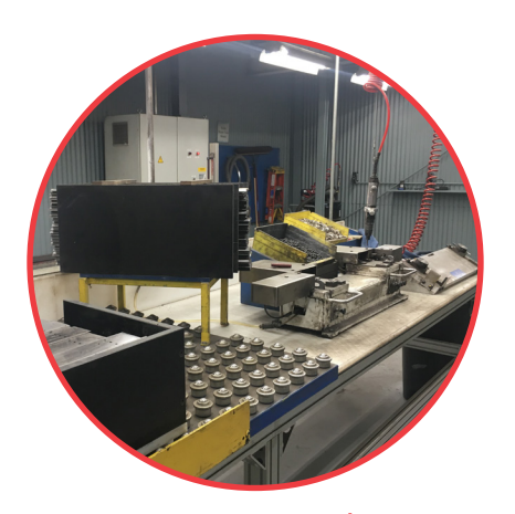
1-3 personnel 12 hrs / day