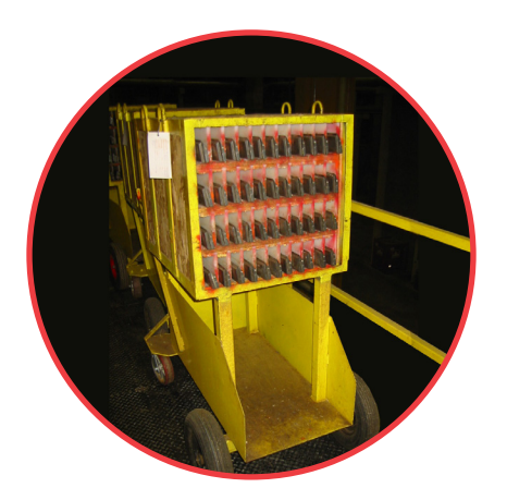
Heavy & Awkward 700 kg